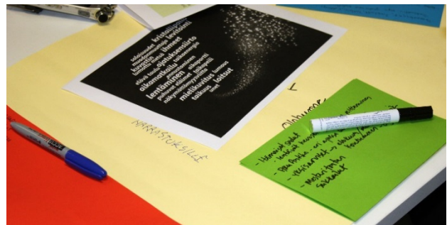
Figure 3: List of the words connected to magic.

The participants were allowed to open up the next page from the task sheet only when they had finished the previous one. The second assignment was called “the Magical Element”. It was accompanied with a sheet of paper including a cloud of words connected to magic; these included words such as “enchanted forest”, “crystal ball”, “flying”, “magic mirror”, and “talking animals” [Fig. 3]. The idea was that participants could use these words as an inspiration; the list was attached into the materials as there was some doubt that magic would otherwise be too broad theme. The participants were asked first to reflect on books, movies or fairy tales they knew and that had included especially impressive magical elements. When connected to the world of fiction and fairy tales, magic was linked with shared meanings found in popular culture. At first participants made some notes individually, and after everybody had come up with a suitable example, they could discuss about their choices for a while; what made these magical elements so impressive? The assignment included only writing and discussing due to the limited timeframe but it could have been interesting to complement it with some sort of visual or crafting task.