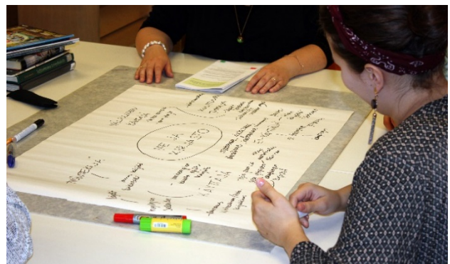
Figure 2: Workshop participants drawing a mind map.

The Library provided us the space, most of the materials used, refreshments and lunch for the participants. Furthermore, all the participants received a small reward sponsored by the library; a ticket to the local science center. University researchers, on the other hand, took care of planning the program and assignments of the workshop. Participants (35 in total) consisted of library users (14), library staff (13) and university researchers (8) having slightly different backgrounds ranging from computer science to architecture and design. However, all of the researchers were already familiar with 3D technologies. Thus, participants held specific knowledge regarding 1) library usage, 2) library as a work site and library as a cultural institution, and 3) VR and AR technologies. It must be noted that these positions overlap easily as researchers can be identified as library users, and some library user participants had expertise on 3D technologies due their professional background. The age of the participants was between 20 to 56 years. All participant groups had both females and males but in total the number of females was a bit higher, 21 individuals.