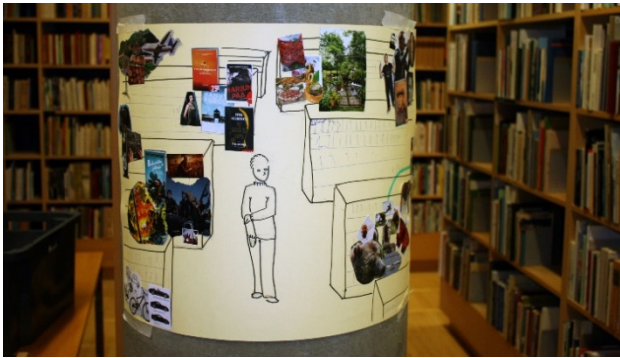
Figure 4: A collage made in the workshop within library surroundings.

workshop every group presented their concepts to the others and ideas were discussed.